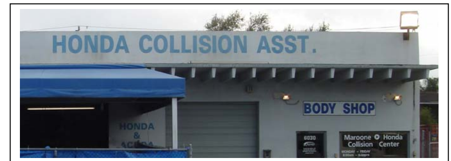
“HONDA COLLISION ASST.” Painted sign – approximately 20’ x 2’ 40 square feet